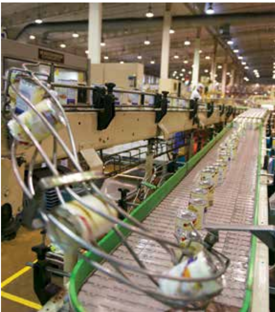
> One of F&N Dairies product packaging production lines